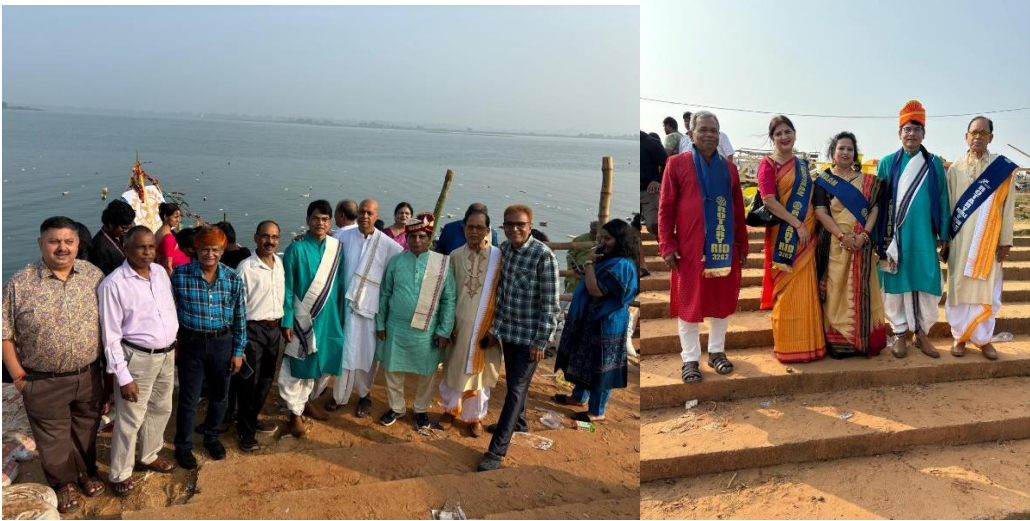
District 3262 - Stall