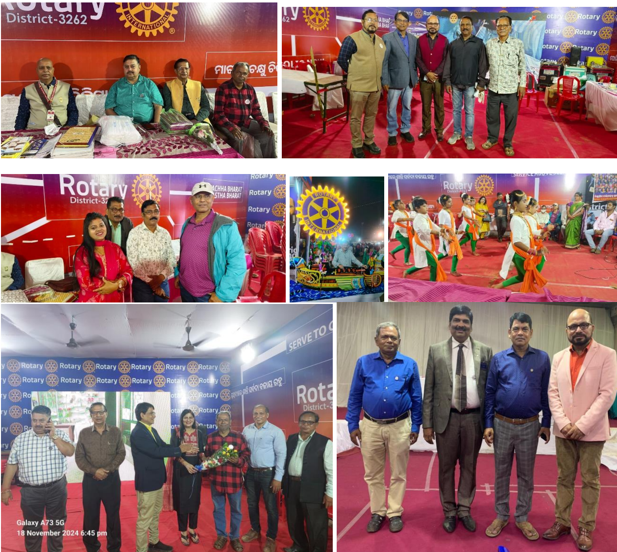
JPM RCC Eye Hospital & RI